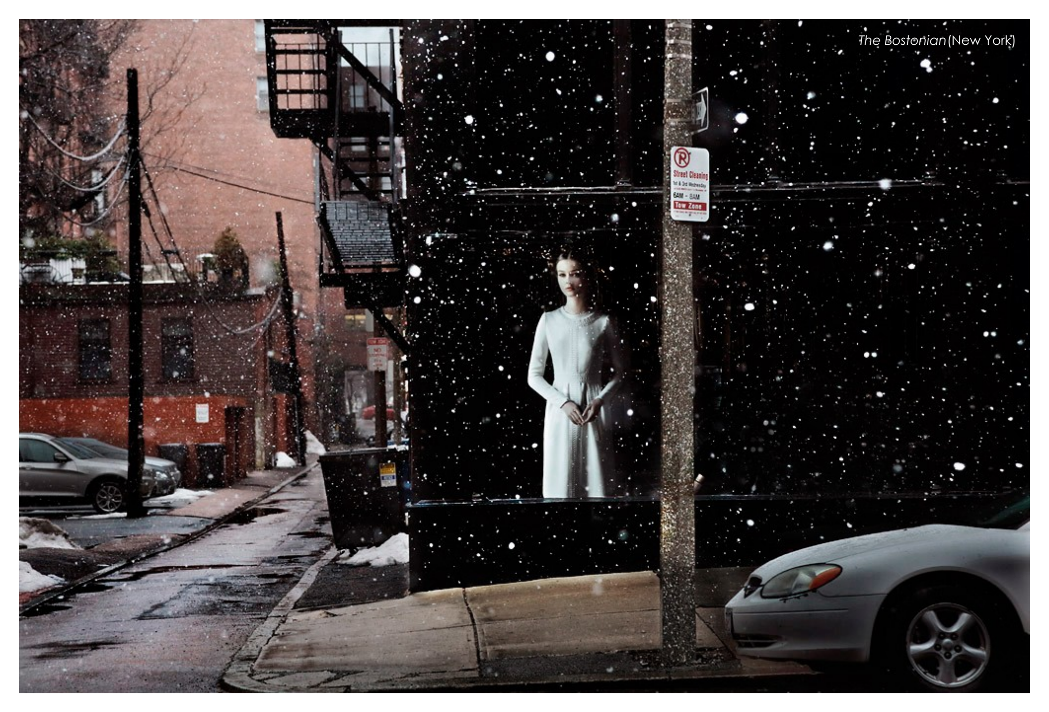
"I try to capture images that are grounded in reality, yet stir the imagination. Snow allows me to make that connection." Christophe Jacrot