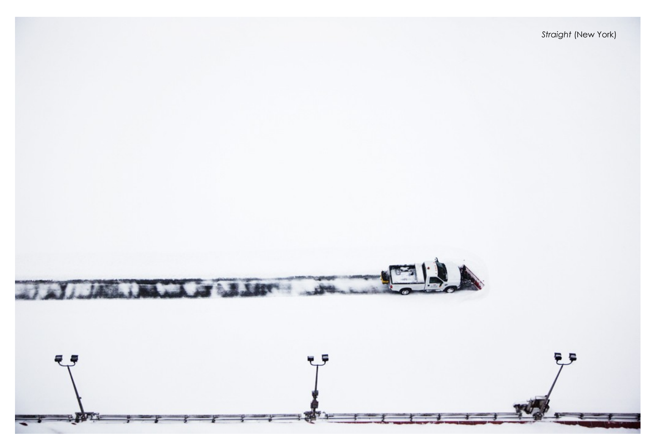
"My photographs should be instantly accessible to viewers, without the necessity of imposing any particular interpretation." Christophe Jacrot