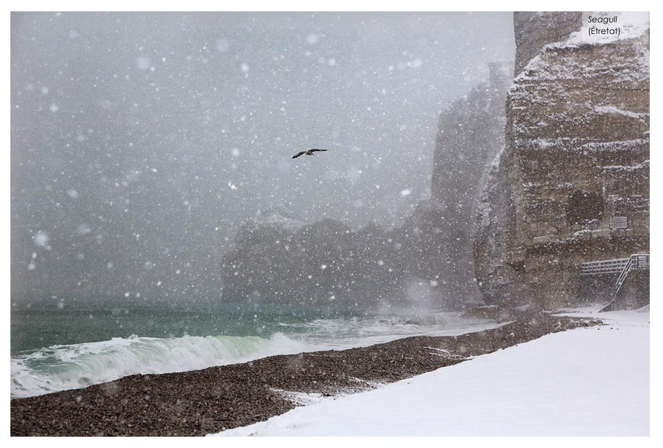
"In my opinion, there are two ways of photographing the world: capturing its horror (there's no lack of material!) or sublimating it. I have chosen the second." Christophe Jacrot